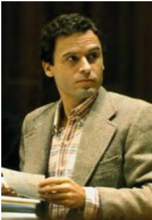
Terrible Ted Bundy