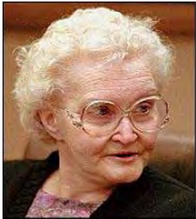
Dangerous Dorothea Puente