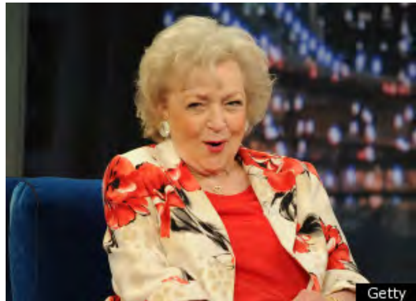
Bubbly Betty White