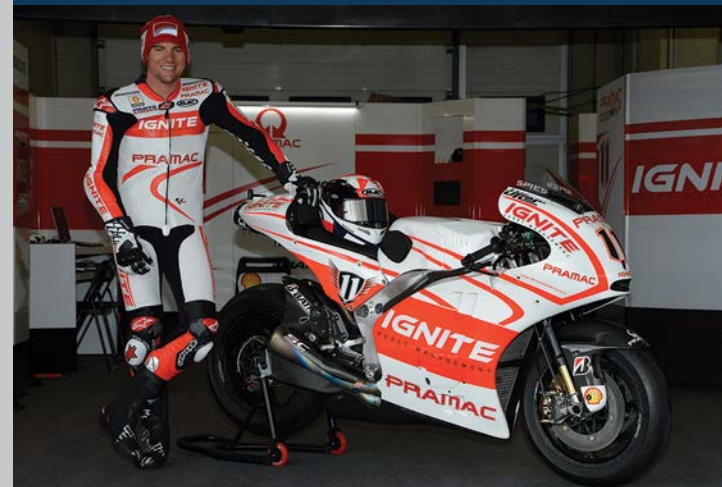
Ben Spies, #11, Pramac Racing Professional Racer, Texan

CHECKING THE FIT OF YOUR MOTORCYCLE HELMET