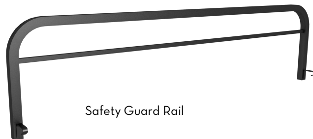
Safety Guard Rail

When changing your bed height or configuration, it is important to disengage both hooks on each end of the spring. If both ends are not disengaged, damage to your bed may occur. Note that lifting up on the spring while one foot is on the lower cross rail disengages the spring. Sometimes it requires an upward tapping under the corner connection to dislodge the spring hooks from the steel rods.