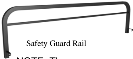
Safety Guard Rail

NOTE: There are no guardrails for full size junior lofts in The Gardens Buildings F thru L, P & Q. Safety guard rails are highly recommended for ALL spring heights. To attach the guard rail, slide the mattress so the guard rail can lay flat on the spring. Engage the two brackets of the guard rail to the spring and raise it to the vertical position. The mattress can now be repositioned and will hold the guard rail in its upright position.