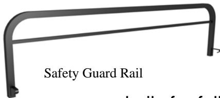
Safety Guard Rail

It is critical to always have the steel bunking pins inserted into each post when lofting the wood ends. It is also critical to be sure that the wood ends are lifted off the bunking pins when disengaging the wood ends as tilting the wood end can damage the wood end if it is still resting over the steel bunking pin. Lifting the wood end up off the bunking pins during any reconfiguration of the loft units will avoid this damage to the wood ends.