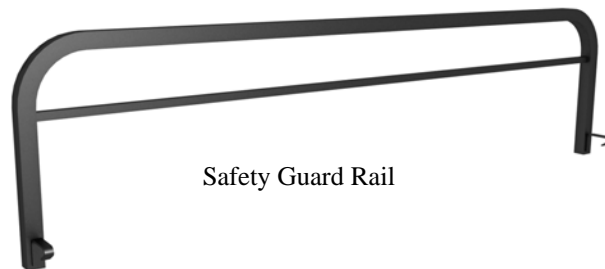
Safety Guard Rail

When changing your bed height or configuration, it is important to disengage both hooks on each end of the spring. If both ends are not disengaged, damage to your bed may occur. Note that lifting up on the spring while one foot is on the lower cross rail disengages the spring. Sometimes it requires an upward tapping under the corner connection to dislodge the spring hooks from the steel rods.