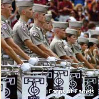
Corps of Cadets